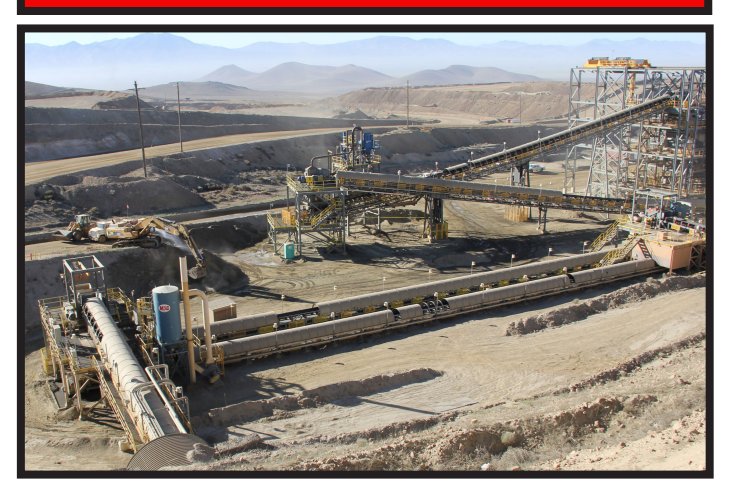
Solids Transfer Systems - Crushing Circuits, Conveyed Products