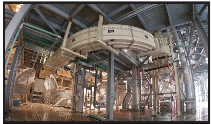
Wet & Mill Transfer Systems - Launders, Mill Feed